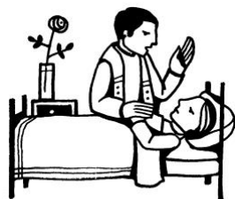
Anointing of the sick

If you are GOING INTO HOSPITAL or know someone who has gone into hospital.... The hospital